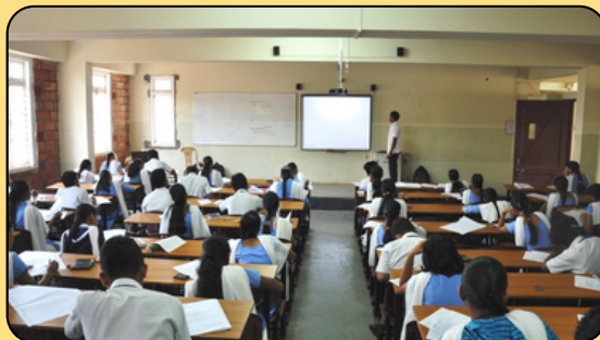
ICT ENABLED CLASSROOMS