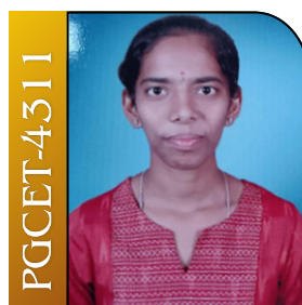
BHAGYA TELI GLOBAL INSTITUTE OF MANAGEMENT SCIENCE, BENGALURU